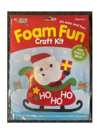
Kit 2 Foam Santa