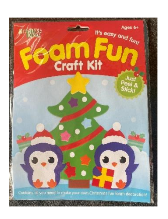
Kit 3 Foam Tree