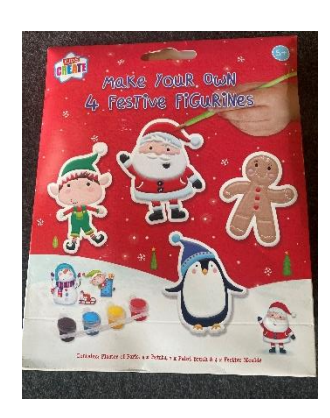
Kit 4 Festive Figurines