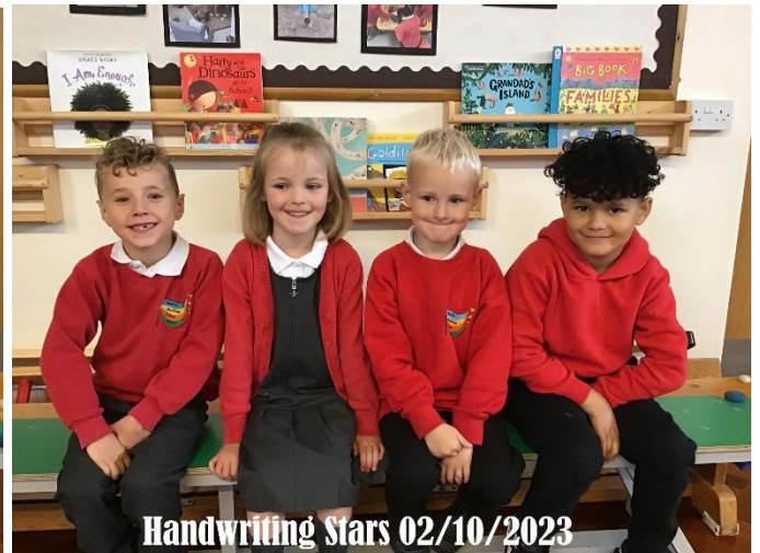
Handwriting Stars 02/10/2023

Congratulations to the children who received awards in assembly on Monday.