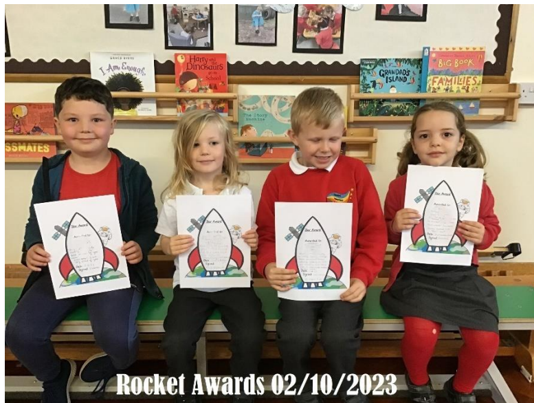
Rocket Awards 02/10/2023