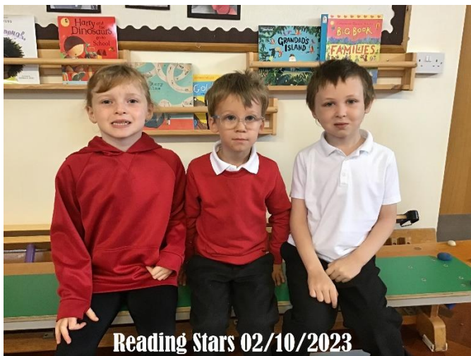
Reading Stars 02/10/2023