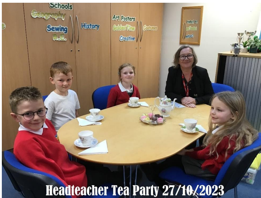
Headteacher Tea Party 27/10/2023

Congratulations to the children who went to the Headteacher's Tea Party on Friday.