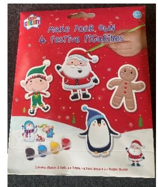
Kit 4 Festive Figurines