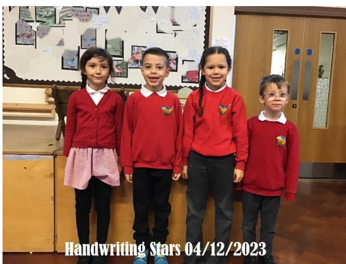
Handwriting Stars 04/12/2023