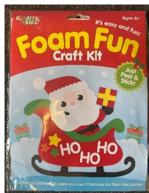
Kit 2 Foam Santa