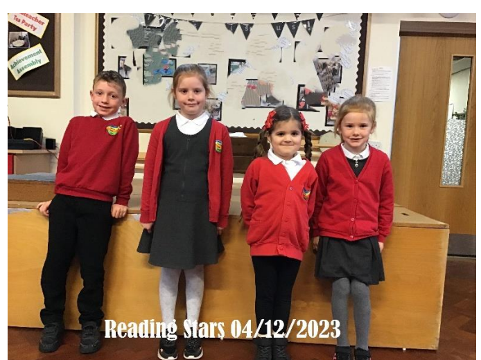
Reading Stars 04/12/2023

Congratulations to the children who went to the Headteacher's Tea Party on Friday and those who received awards in assembly on Monday.