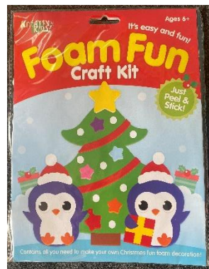
Kit 3 Foam Tree