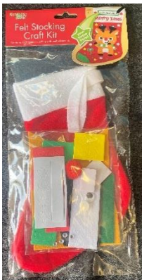
Kit 1 Felt Stocking

We still have some Christmas craft kits available (£2.50 each). Payment can be made on School Spider or by sending cash in a named envelope stating which kit you want to buy.