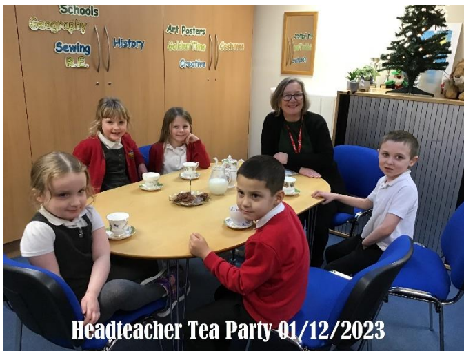
Headteacher Tea Party 01/12/2023