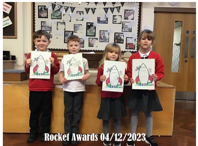
Rocket Awards 04/12/2023