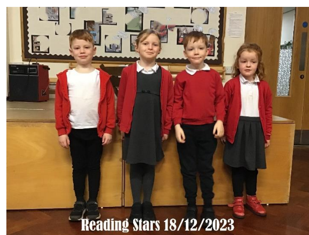
Reading Stars 18/12/2023

Congratulations to the children who went to the Headteacher's Tea Party on Friday and those who received awards in assembly on Monday.