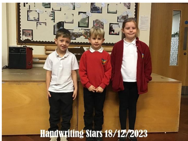
Handwriting Stars 18/12/2023