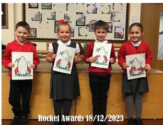
Rocket Awards 18/12/2023