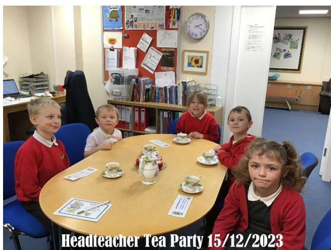
Headteacher Tea Party 15/12/2023