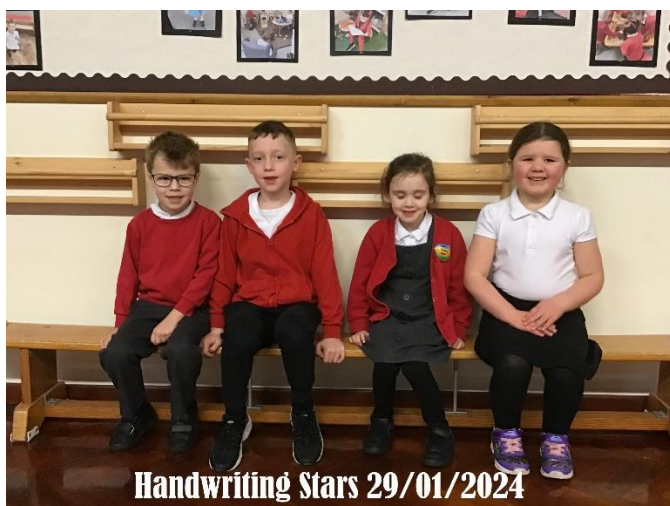
Handwriting Stars 29/01/2024