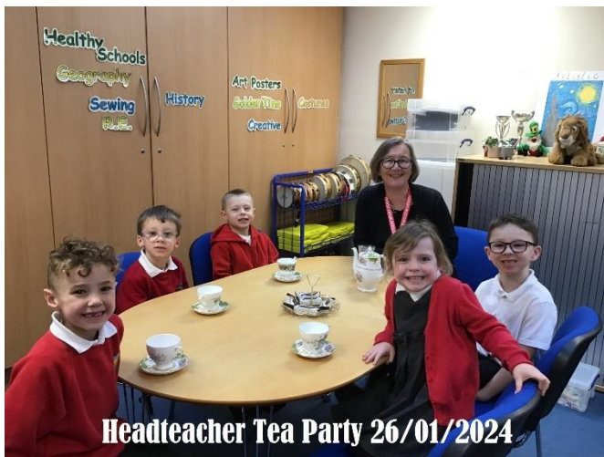
Headteacher Tea Party 26/01/2024