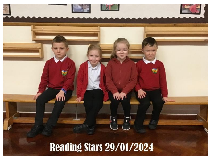
Reading Stars 29/01/2024

Congratulations to the children who went to the Headteacher's Tea Party on Friday and those who received awards in assembly on Monday.