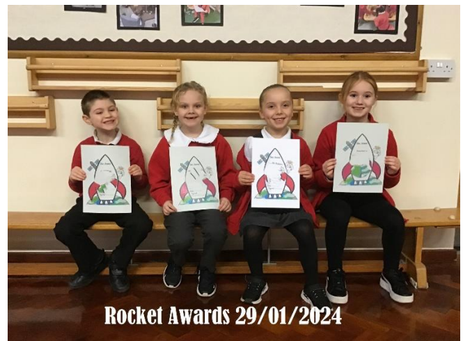
Rocket Awards 29/01/2024