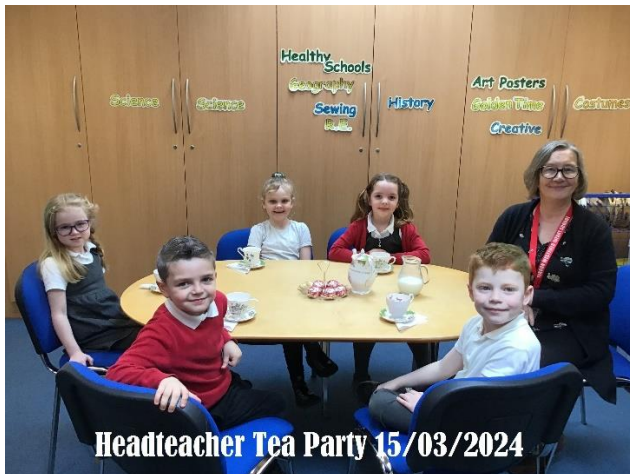
Headteacher Tea Party 15/03/2024