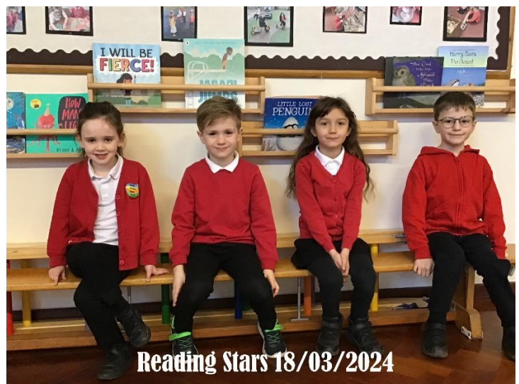
Reading Stars 18/03/2024

Congratulations to the children who went to the Headteacher's Tea Party on Friday and received awards in assembly on Monday.