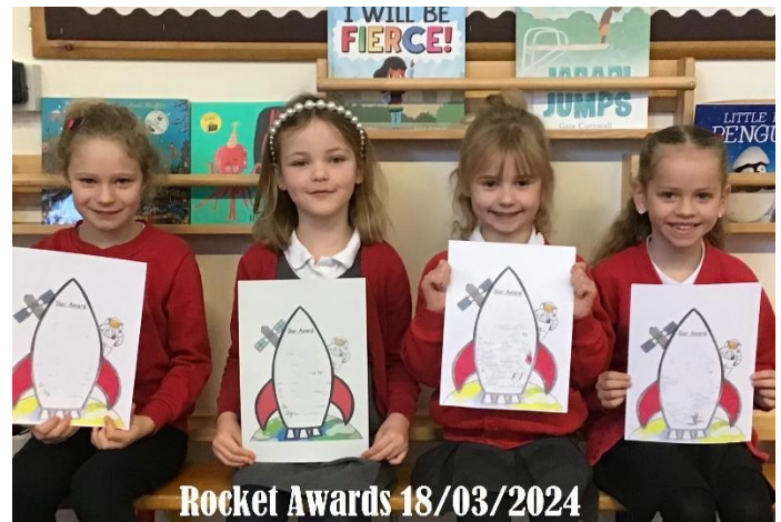
Rocket Awards 18/03/2024