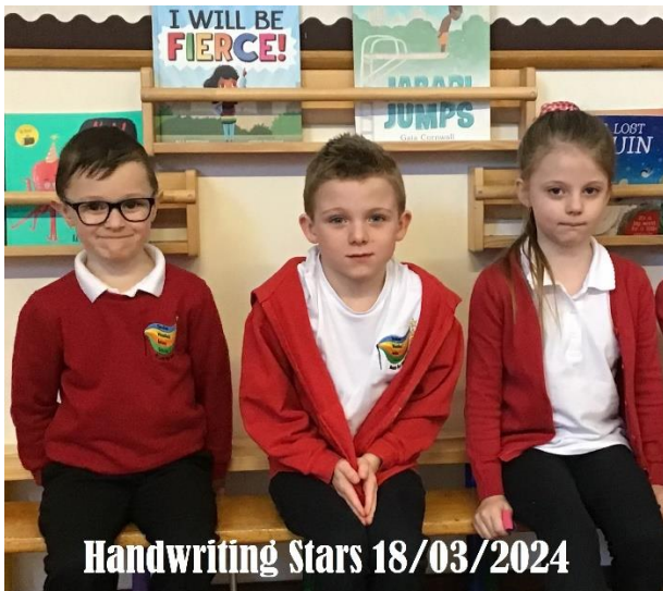
Handwriting Stars 18/03/2024