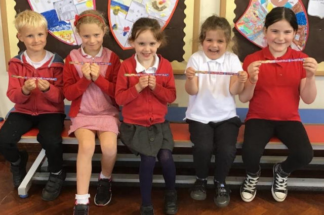
Headteacher Tea Party 07/06/2024