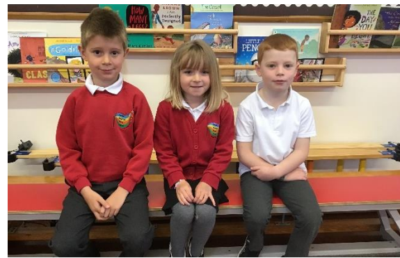
Handwriting Stars 17/06/2024

Congratulations to the children who went to the Headteacher's Tea Party on Friday and those who received an award in assembly on Monday . More photographs are available on the website .