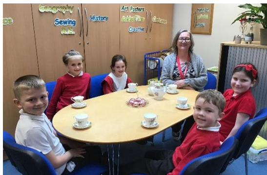
Headteacher Tea Party 14/06/2024