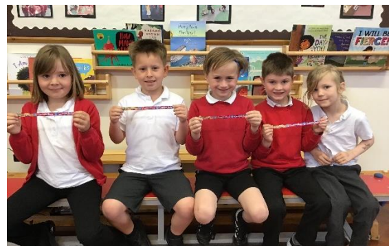
Lunchtime Stars 17/06/2024