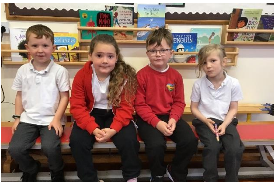
Reading Stars 17/06/2024