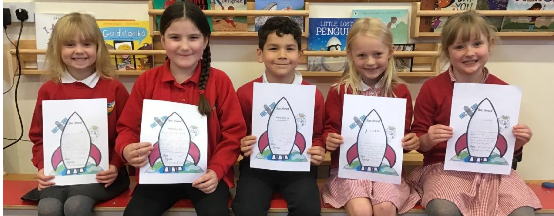
Rocket Awards 17/06/2024