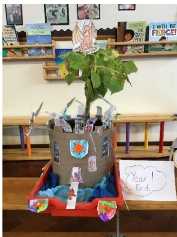
YEAR 1 RED