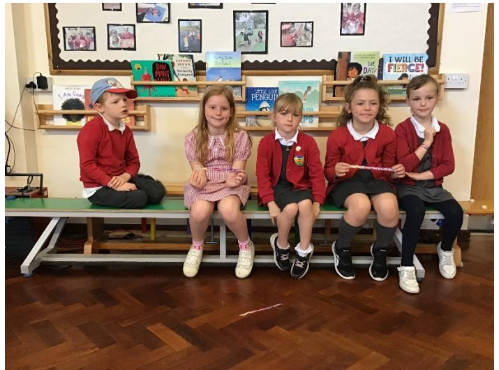
Lunchtime Stars 15/07/2024

Congratulations to the children who received an award in assembly. More photographs are available on the website .