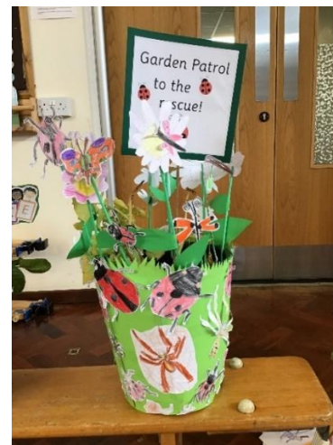
YEAR 1 BLUE