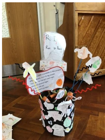
YEAR 2 BLUE