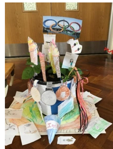
YEAR 2 RED